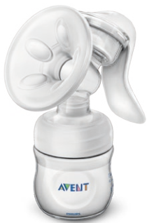
Philips Avent Comfort manual breast pump