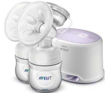
Philips Avent Comfort double electric breast pump

Since the introduction of our (ISIS) breast pump in 1997, we have been incorporating our knowledge about the peristaltic action into the development of our breast pumps. Our unique massage cushions have soft petals that gently compress the breast in synchronization with the pump's suction to conveniently stimulate and promote milk expression. The efficacy of our manual and electrical breast pumps has been evaluated in three clinical studies which have shown that our unique combination of compression with vacuum has resulted in similar amounts of expressed milk volume when compared to hospital-grade electrical breast pumps [15,16,24,25]. Additionally, in these studies, mothers have consistently rated our products higher on several aspects, notably