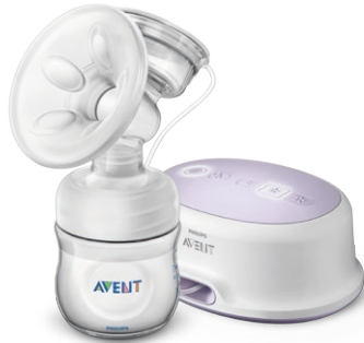
Philips Avent Comfort single electric breast pump