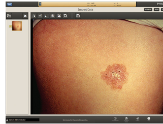
Quick upload from image capture to PACS

IntelliSpace VL Capture is just one of the ways Philips is broadening the capabilities of your trusted, clinically focused PACS to make it an enterprise-wide solution. Through tools such as IntelliSpace VL Capture, IntelliSpace PACS Radiology Analytics, Oncology Dashboard, and Measurement Assistant, your IntelliSpace PACS is an essential and integrated part of your enterprise that offers intelligent clinical workflows, personalized care, and longitudinal patient records.