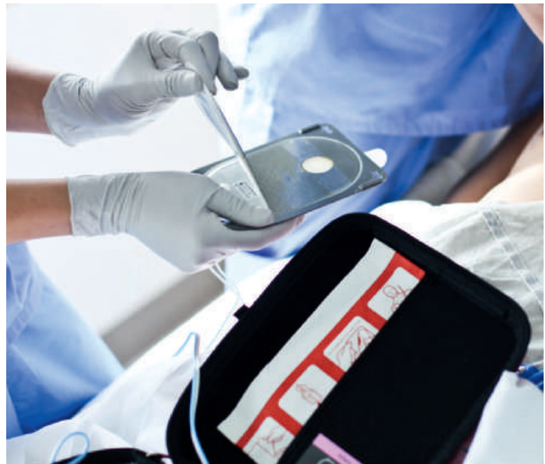
The HeartStart FR3 is the smallest and lightest professional-grade AED among the leading global manufacturers.