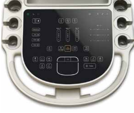
Simplicity Mode – ON