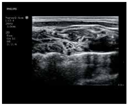
Supraclavicular brachial plexus