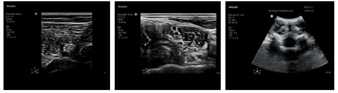
Sciatic nerve at popliteal level