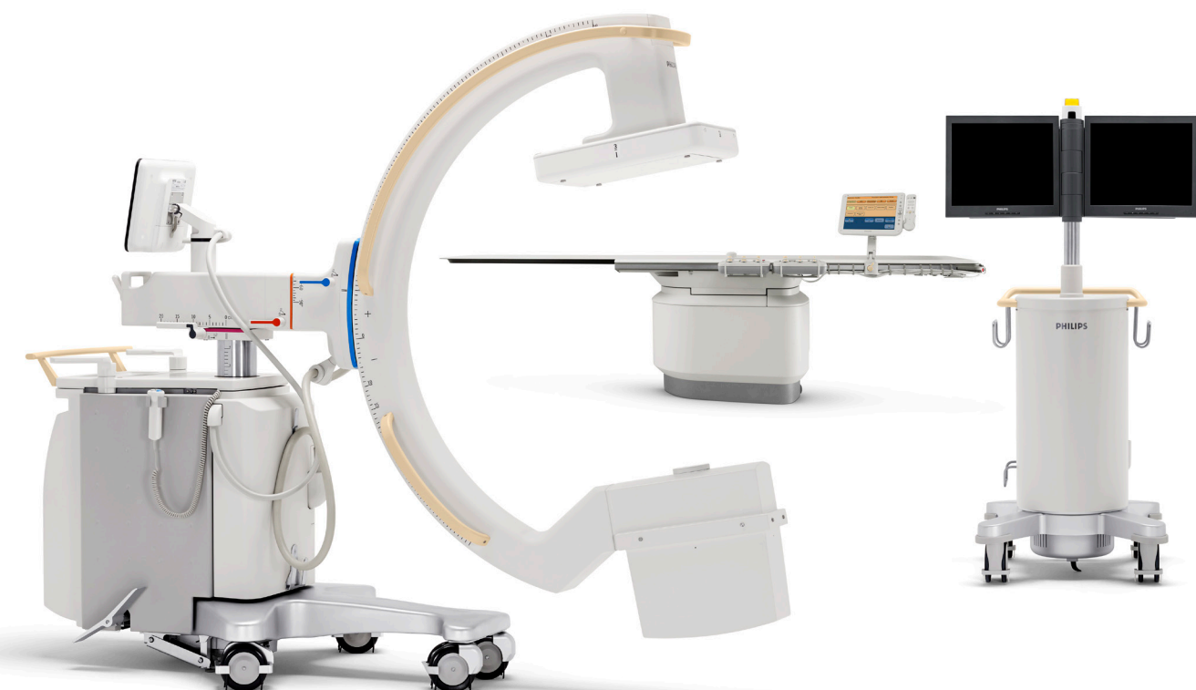
Veradius Unity Mobile C-arm with flat detector