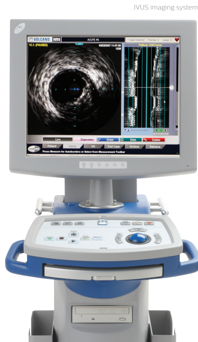
IVUS imaging system

With a broad portfolio of industry leading equipment, responsive service organization, construction partnerships, site planning expertise, and competitive financing options, Philips offers distinctive solutions to help support you whether you are looking to open a new lab or already have an established business.