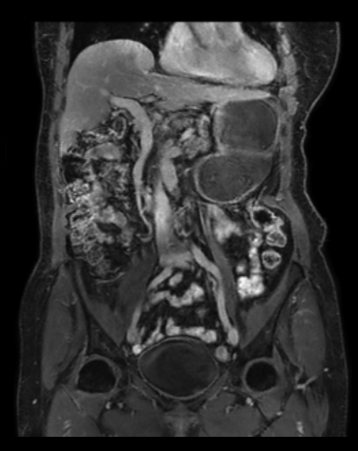
mDIXON XD - T1w FFE Water only, post-gado 1.4 x 1.9 x 3.0 mm, 0:12 min SmartPath to dStream 3.0T

© 2016 Koninklijke Philips N.V. All rights reserved. Specifications are subject to change without notice. Trademarks are the property of Koninklijke Philips N.V. or their respective owners.