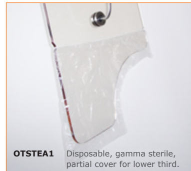
OTSTE1 Disposable, gamma sterile, partial cover for lower third.

OT50001 OT90001 E-OT25B05 STEA-OT5 or OTSTE1