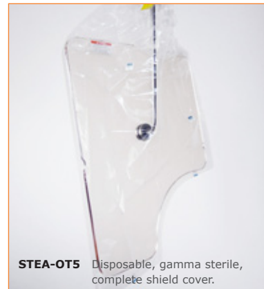
STEA-OT5 Disposable, gamma sterile, complete shield cover.