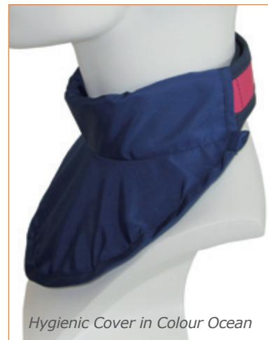
Hygienic Cover in Colour Ocean