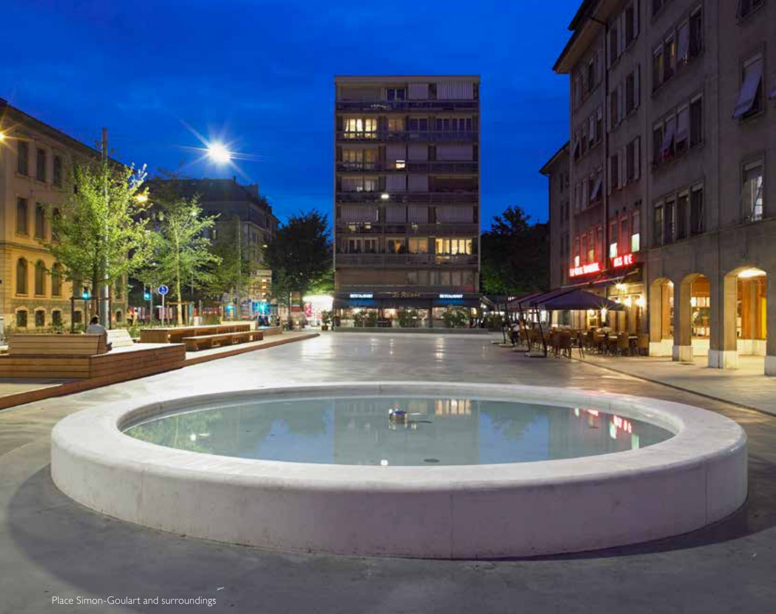
Place Simon-Goulart and surroundings