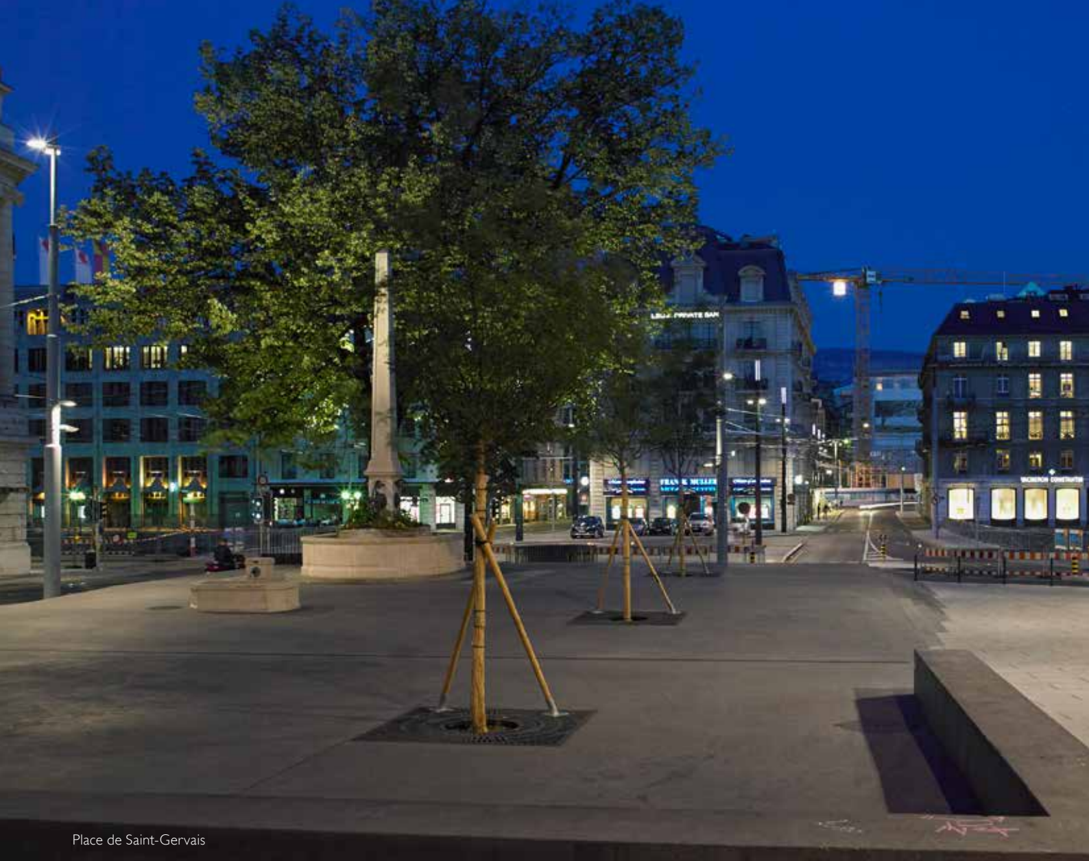
Place de Saint-Gervais