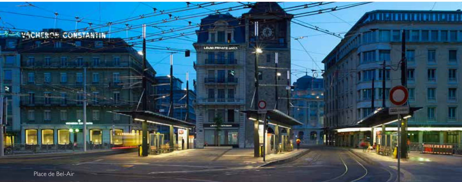
Place de Bel-Air

The quality of the implementation stands out. Excellent example of urban development where the three places have been connected by coherency, guided lighting to direct people to the different areas.