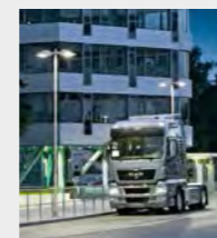
8 Outdoor parking and streets