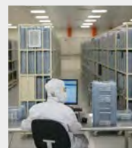
4 HACCP areas and cleanroom