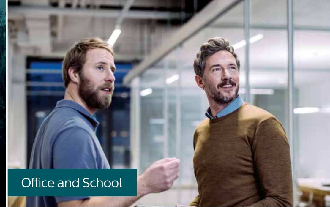
Office and School