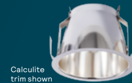
Calculite trim shown

LED downlight features industry leading visual comfort (50° cut-off), excellent uniform illumination over time, and patented installation flexibility.