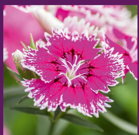
Esmeralda Farms (Cut flowers)

"Two years ago we did a trial with the Philips GreenPower LED flowering lamps in Naivasha, Kenya. At first we were surprised by the colour of the light, but soon we were also impressed with the results. No flower induction and an extreme reduction in energy costs. At the moment we are also rolling it out in other motherstock plants, to improve our cutting quality even more, and reduce in electricity costs."