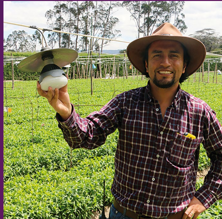
Esmeralda Farms (Cut flowers)

“After four months working with the LED flowering lamps, an outstanding 91% reduction in energy costs, amounting to a total of US$ 18,000, was achieved. This is equivalent to an energy saving of US$ 16.50/hour/hectare. It is estimated that the investment will be recouped within the space of 11 months. The long lifetime and improved water resistance of the LED flowering lamps resulted in reduced labor costs, because now there is no need for the lamps to be replaced every day.”