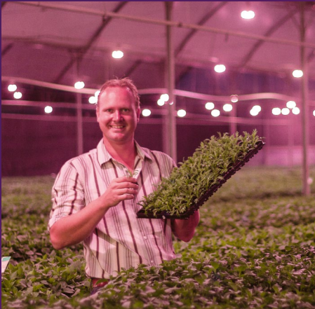
Florensis Kenya Ltd. (Bedding plants)

Given that light is an important production resource for growers and also represents an important factor in plant research, Philips has been carrying out various practical tests in conjunction with horticultural companies and research experts. These tests provide valuable information that can be used in product design. They also highlight the versatility of LED solutions and the cost-effective opportunities they offer for ensuring optimum yield and plant quality.