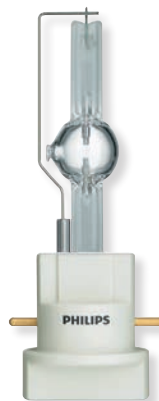
MSR Gold™ MiniFastFit