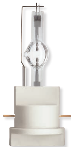
MSR Gold™ FastFit