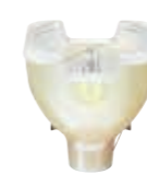
MSD Platinum 15 R MSD Platinum 16 R