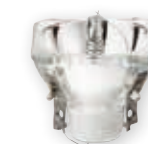
MSD Platinum 2 R