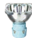
MSD Platinum 5 R MSD Platinum 14 R