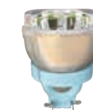
MSD Platinum 20 R(B) NEW MSD Platinum 21 R