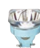
MSD Platinum 11 R MSD Platinum 17 RA