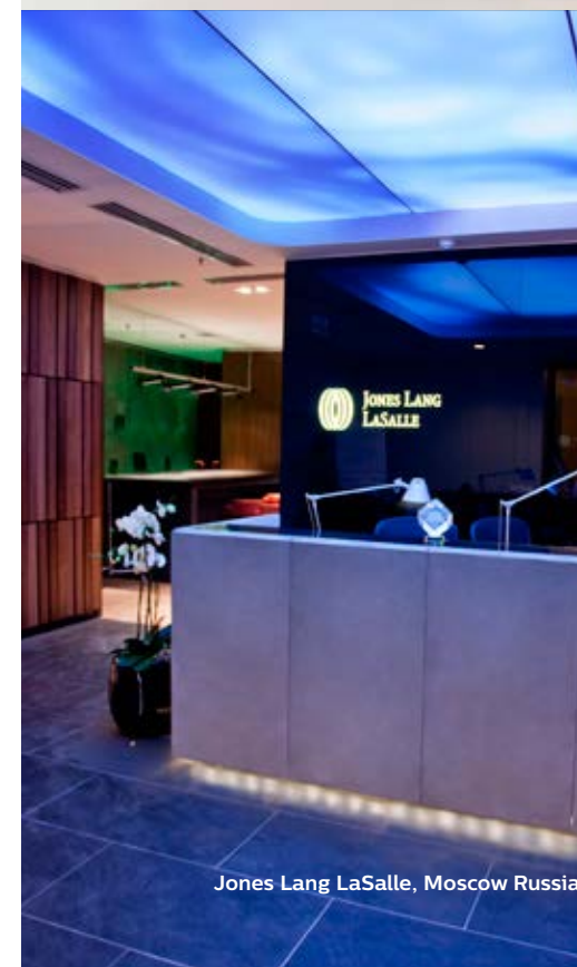
Jones Lang LaSalle, Moscow Russia