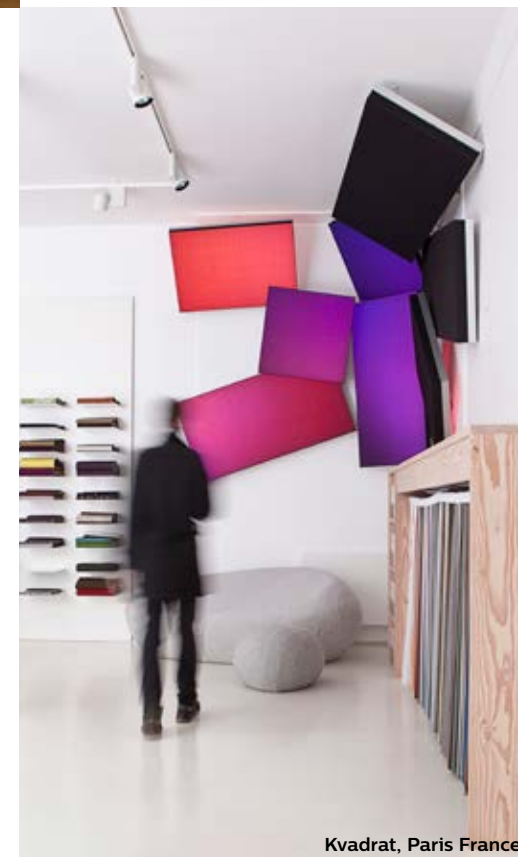
Kvadrat, Paris France

Luminous textile is not intended for information or sales messages. Rather than overloading the senses, it creates soft atmospheres and ambiances. The combination of soft, diffused light and the aesthetics of the material creates a very special effect that has an almost dreamlike quality. With design freedom and fully customizable content, it makes the possibilities for mood creation endless. How will it light your creativity?