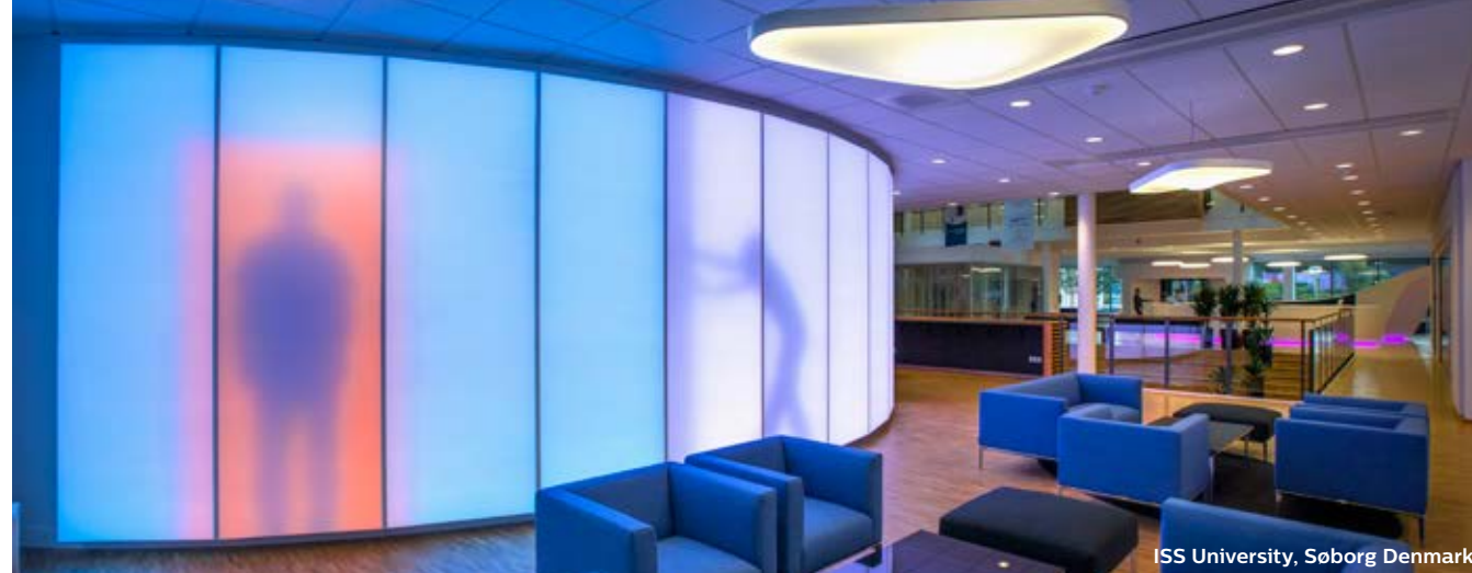
ISS University, Søborg Denmark