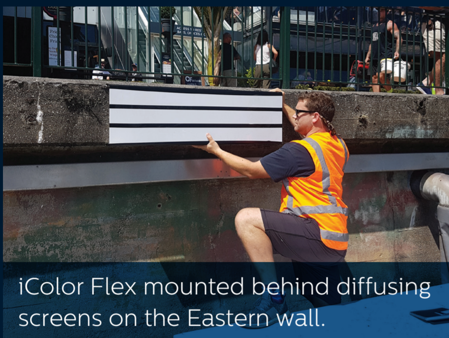
iColor Flex mounted behind diffusing screens on the Eastern wall.