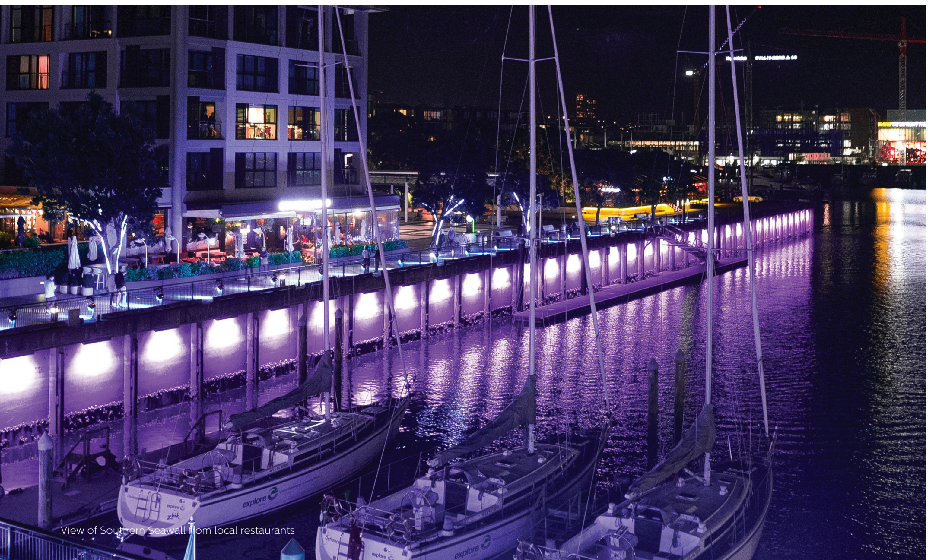
View of Southern Seawall from local restaurants