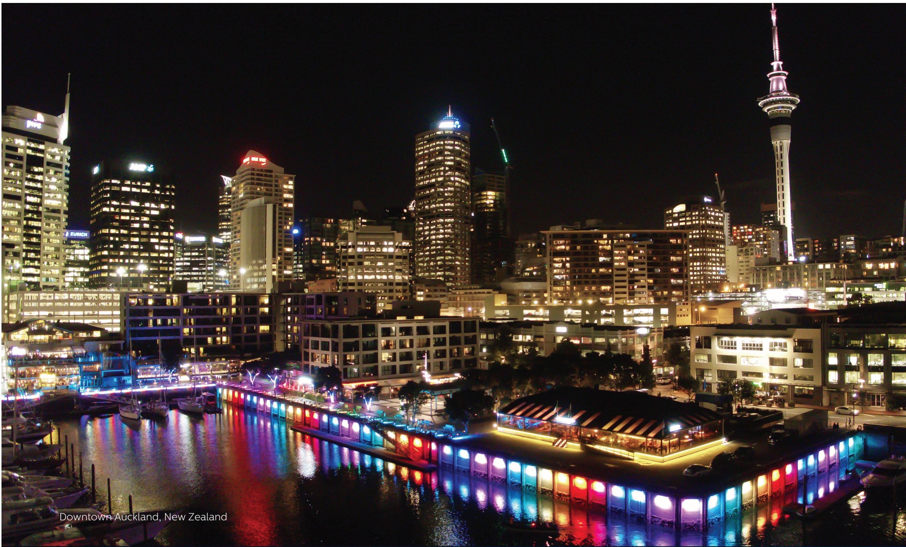
Downtown Auckland, New Zealand