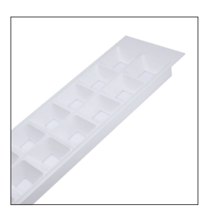
PowerBalance RC600B Recessed - Rectangle

*Also availabe in 297mm x 597mm and 1197mm x 148mm and 1492mm x 148mm