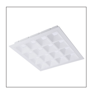
PowerBalance RC600B Recessed - Square