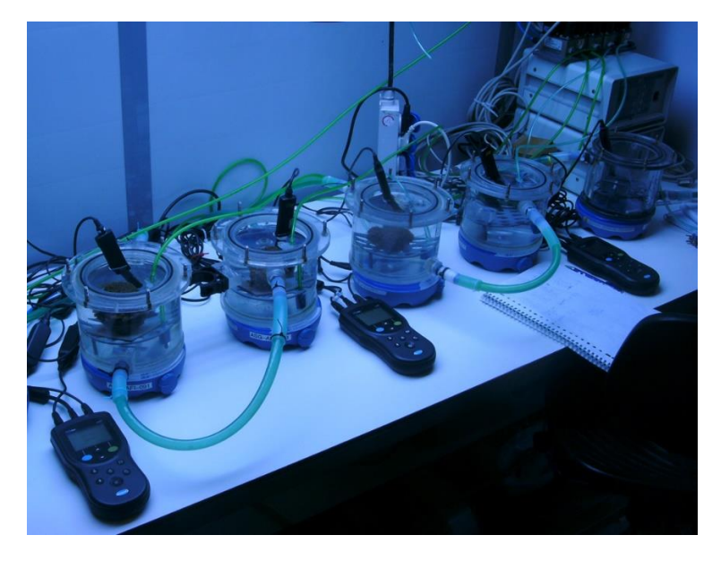
With CORALAB, the effects of light on coral health, growth and coloration will be studied in detail.