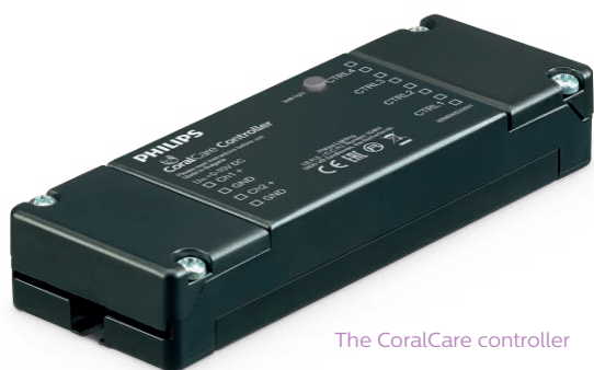
The CoralCare controller