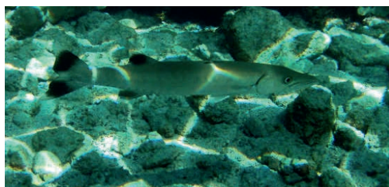
Caustics caused by sunlight projected on the ocean floor

The chosen architecture results in an optimal balance between efficiency, uniform light distribution in the aquarium, color homogeneity and the right level of light dynamics.