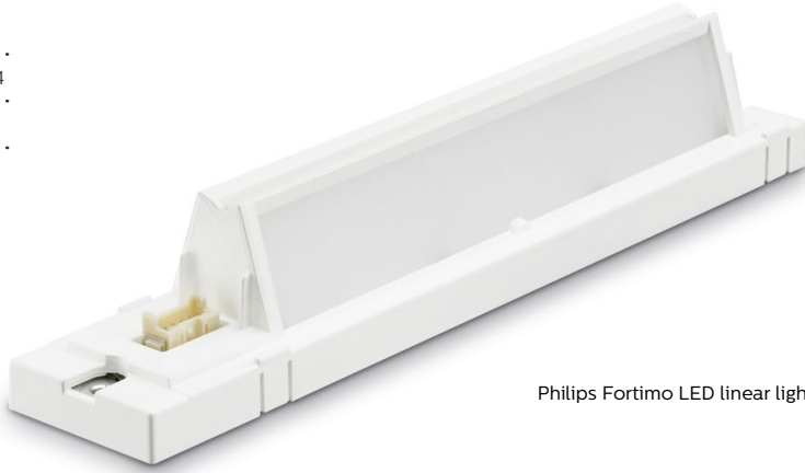
Philips Fortimo LED linear light module Gen4