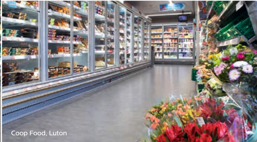
Coop Food, Luton