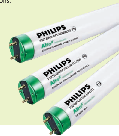
Philips T8 25W Extra Long Life Lamps featuring ALTO II™ Technology have a picogram per lumen-hour score of 20.

Lamps containing no mercury may be counted toward plan compliance only if they have energy efficiency at least as good as their mercury-containing counterparts.