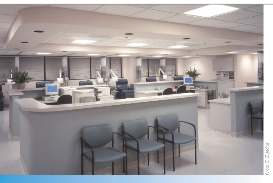
Ideal for commercial applications with 2' x 2' fixtures