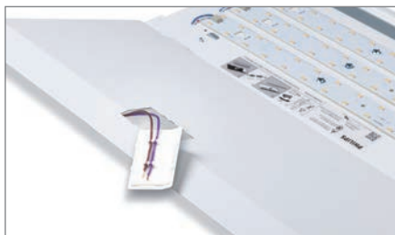
Step 2: The plate can be removed before or after you install EvoKit SR. Just gently slide the plate to one end and remove.