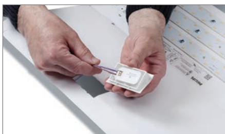
Step 4: Take these two wires and insert them into the sensor. They are not polarity sensitive.