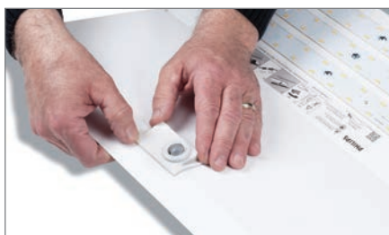
Step 5: Insert the sensor back into the hole. The sensor may or may not require a socket.