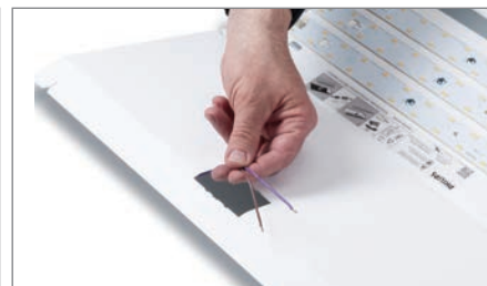
Step 3. Remove the two wires that were secured to the back of the plate.