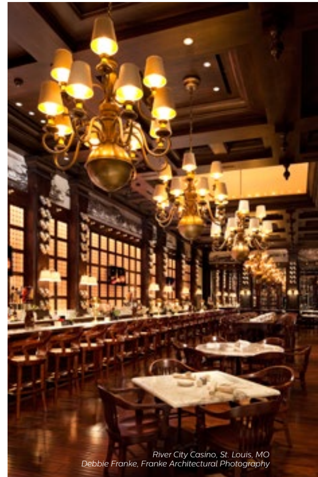
River City Casino, St. Louis, MO

Once we have that vision, we work collaboratively with the other project team members from an engineering standpoint, which almost always involves controls now. It used to be that there were simple controls