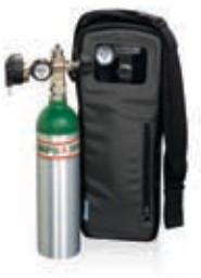
Small cylinder bag 1065701