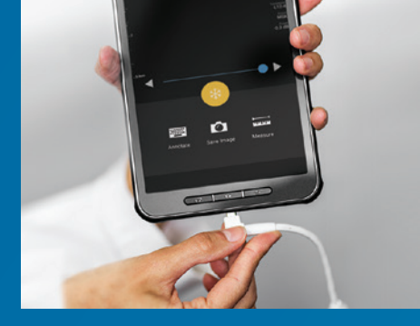
Just plug the transducer into the USB port of your compatible smart device and you're ready to begin scanning.