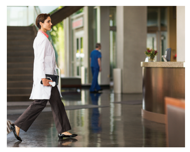
Lumify combines all the advantages of Philips innovation to bring you truly mobile ultrasound capability.