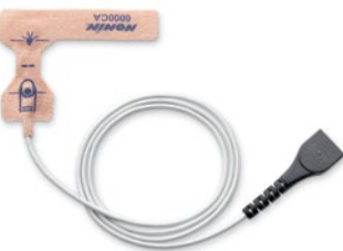
Pulse oximeter sensor, adult (1070692)