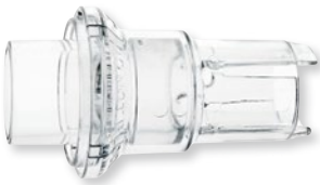
Whisper swivel II (332113)