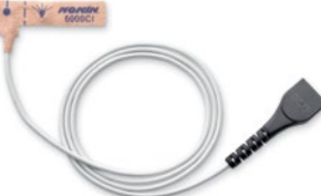
Pulse oximeter sensor, infant (1070694)