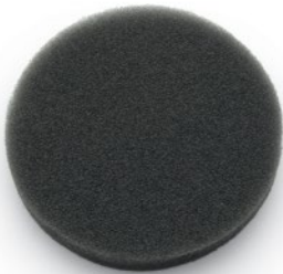
Air Inlet Foam Filter (1134591 10/pack)