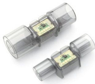
Electronic flow sensor, adult and infant (1134711) (1134712)