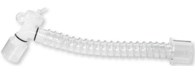
Flexible trach adapter with 22 mm connection (1073902 10/pack) Connects to exhalation ports used with the passive circuit.