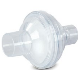
Bacterial filter (342077 10/pack)