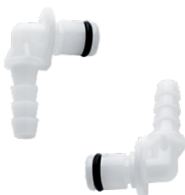
Oxygen inlet adapter (1040390)