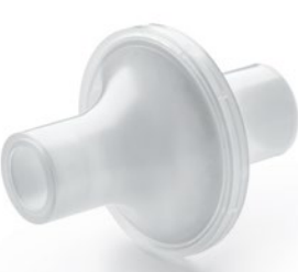
Bacterial/viral filter (1135776 10/pack)