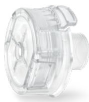
Dual limb AEV (1139436 10/pack)