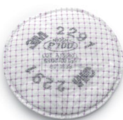
Particulate filter (1134430 10/pack)