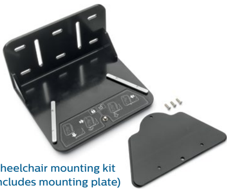
Wheelchair mounting kit (includes mounting plate) (1134633)