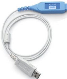
External pulse oximeter (1129640)