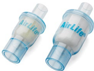
Airlife, pediatric (C06273) Airlife, adult (C06274)