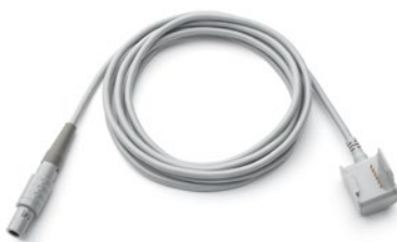
Electronic flow sensor cable (1134592)