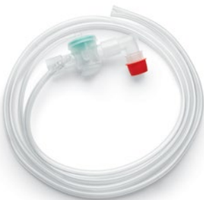
Disposable active exhalation valve (1131661 10/pack)