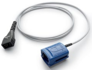
Re-usable adult SpO2 sensor (Nonin) (936)