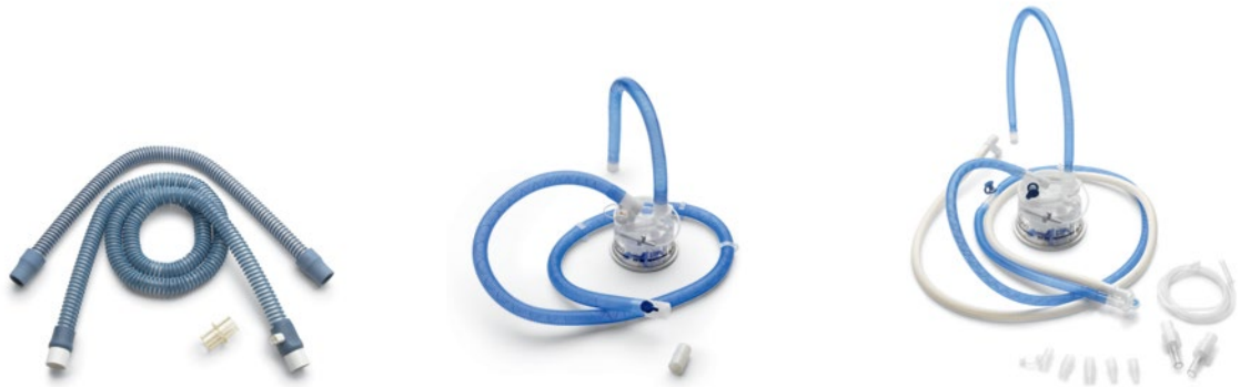
Fisher & Paykel 900MR810 reusable circuit (1141549) RT202 adult single limb heated circuit kit (1141426) RT265 Fisher & Paykel infant dual limb (1141548)