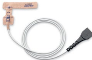
Pulse oximeter sensor, pediatric (1070693)