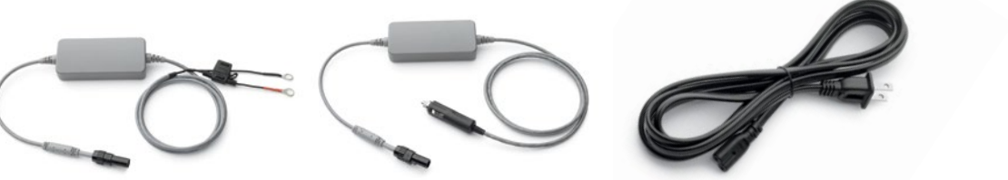
Cable, 12/24V battery with terminals (1127401) Cable, 12/24V battery with car adaptor (1127402)