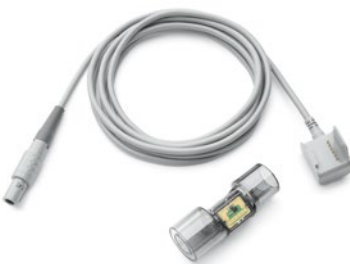
Electronic flow sensor accessory with cable, adult/ped (1132106 )