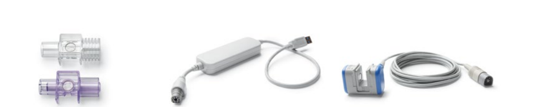
Capnostat airway adaptor (1020709) (1020711) Capnostat USB adaptor (1127404) Capnostat cable (1020220)