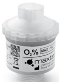
FiO2 sensor assembly (1134668)