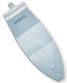
Test lung (1021671)