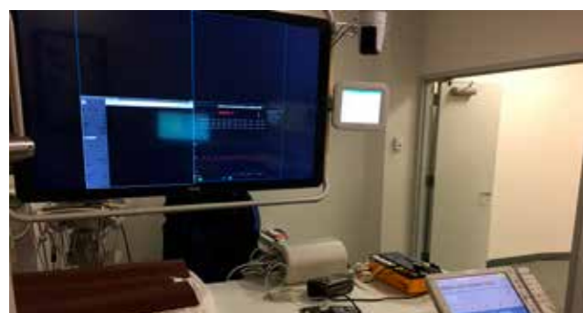
Test set-up in an exam room showing the exam room user interface, TSM workspot, FC2010 monitoring device and Fluke Vital Signs patient simulator.

The study carried out a multi-user test in a realistic setting to simulate how the system will be used in clinical practice. During the study, the participants received training and hands-on practice with the system before performing the tests.