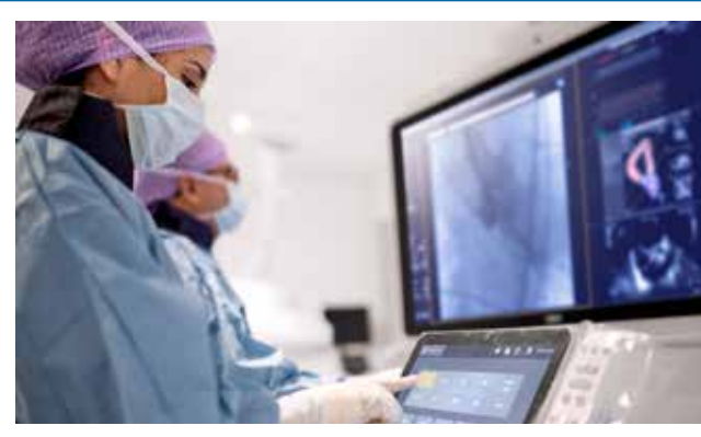
Control of Philips Hemo on Touch Screen Module