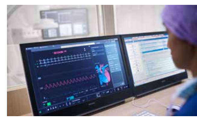
Graphical interaction and user guidance through the procedure