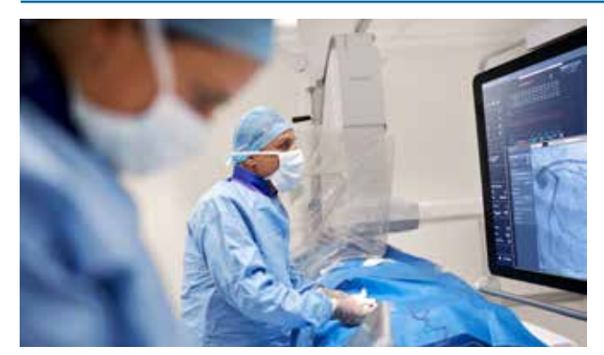
Hemodynamic analyses performed in the control room can be shown in the exam room to help the users to stay focused on the task at hand.

of the users believe the system can be confidently used by all staff members with minimal training<sup>1</sup>