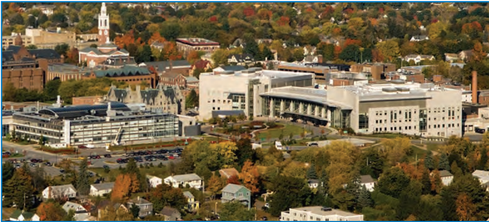
After evaluating the options, the UVMMC team selected Philips' Vereos digital PET/CT.