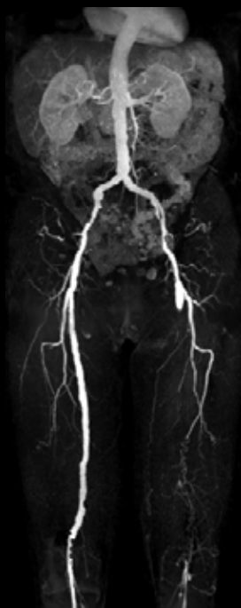
mDIXON XD MultiStation Peripheral MR Angiography 2.1 x 1.8 x 1.5 mm 0:14 min /station Ingenuia 1.5T

1 Compared to the standard Philips mDIXON algorithm