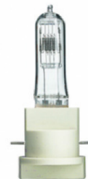
Philips Hi-Brite 1200 FastFit