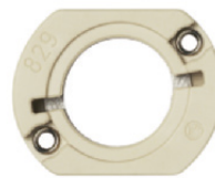
Lamp holder PGJX28 MiniFastFit