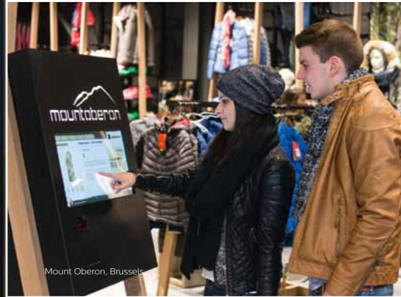
Mount Oberon, Brussels