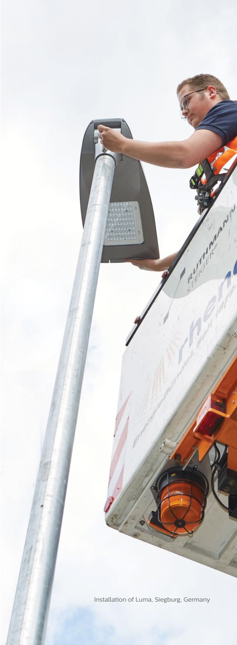
Installation of Luma, Siegburg, Germany

Click here to find out more about CityTouch Ready Partner Program