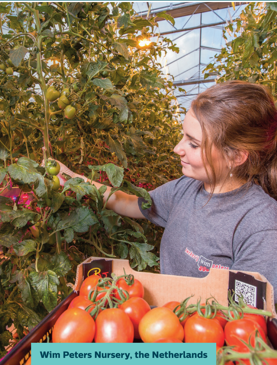
Wim Peters Nursery, the Netherlands