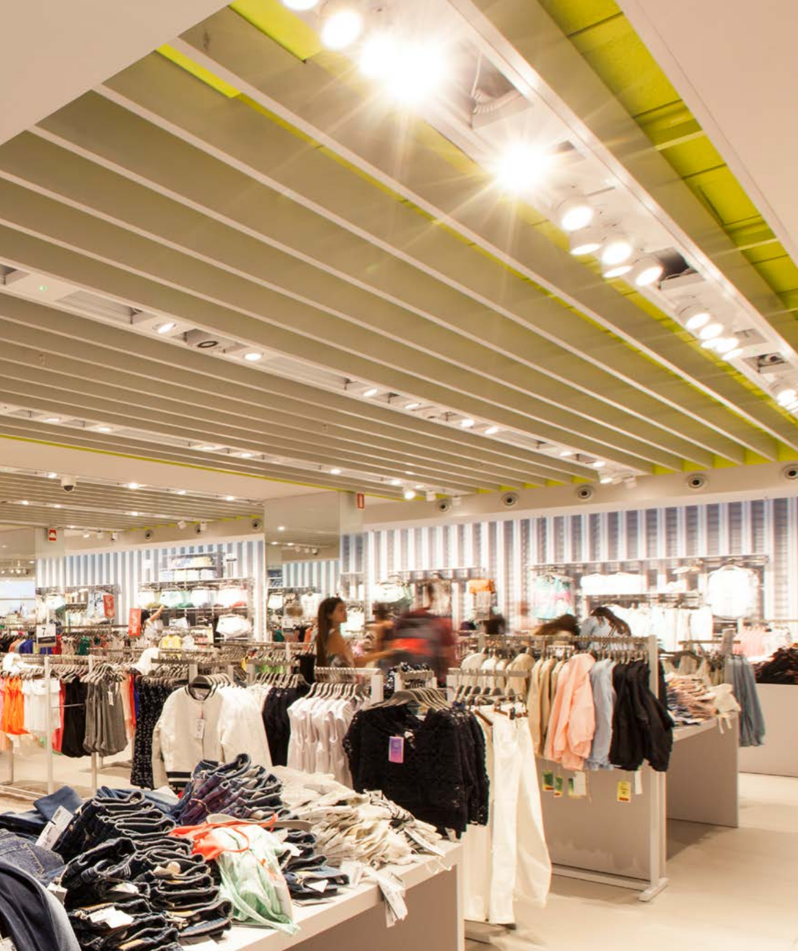
LED lighting Valencia, Spain Bershka

To finish off its flagship store, Bershka didn't want to leave without mentioning the facade of the building, classified within the Valencian neoclassicism from the end of the 19th century. "The details in the illumination are to make them have the difference between a flagship store and the other that it is not", says German. "In this case, we have provided the facade with system of dynamic lighting that plays with different shades of white".