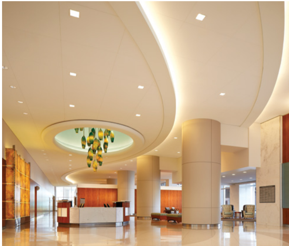
Top left: Photo of Helen Diemer