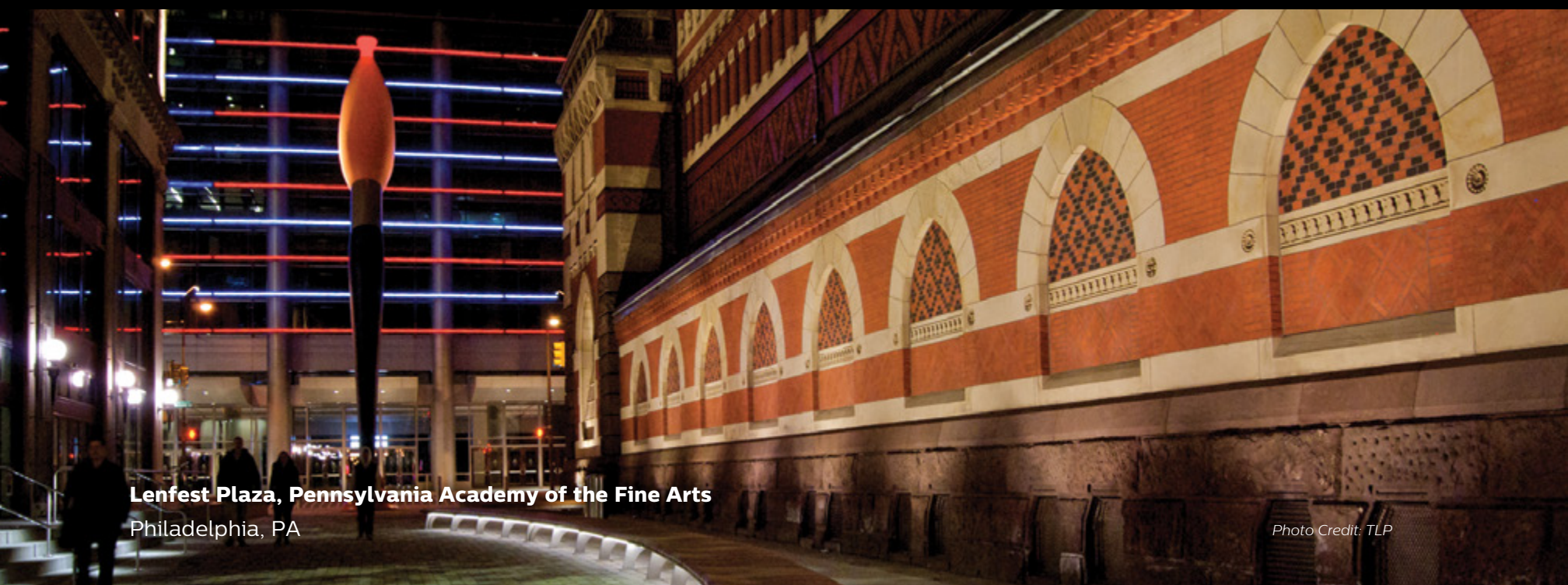
Lenfest Plaza, Pennsylvania Academy of the Fine Arts Philadelphia, PA