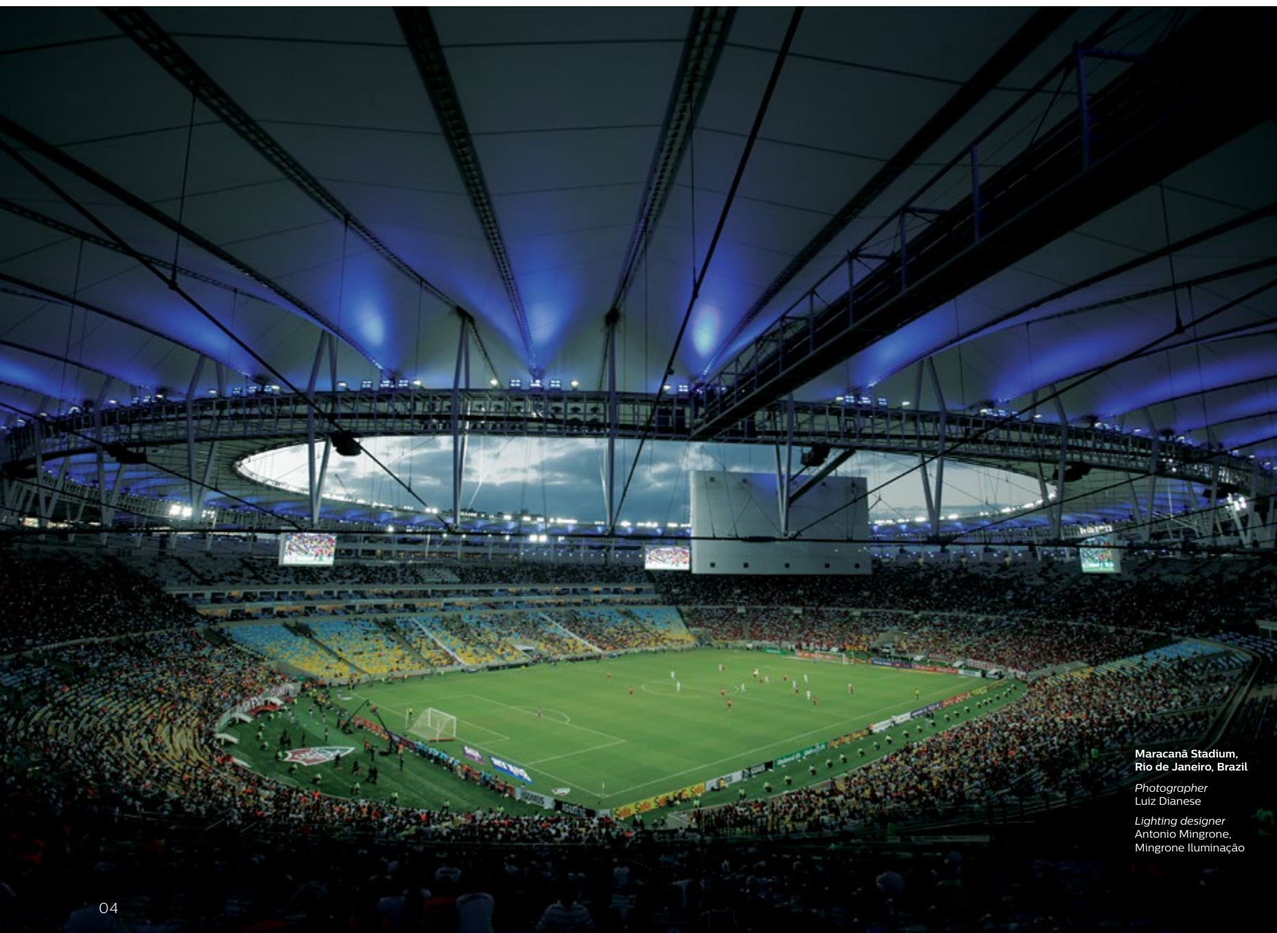
Maracanã Stadium, Rio de Janeiro, Brazil

Visit bit.ly/ArenasStadiums to learn more.