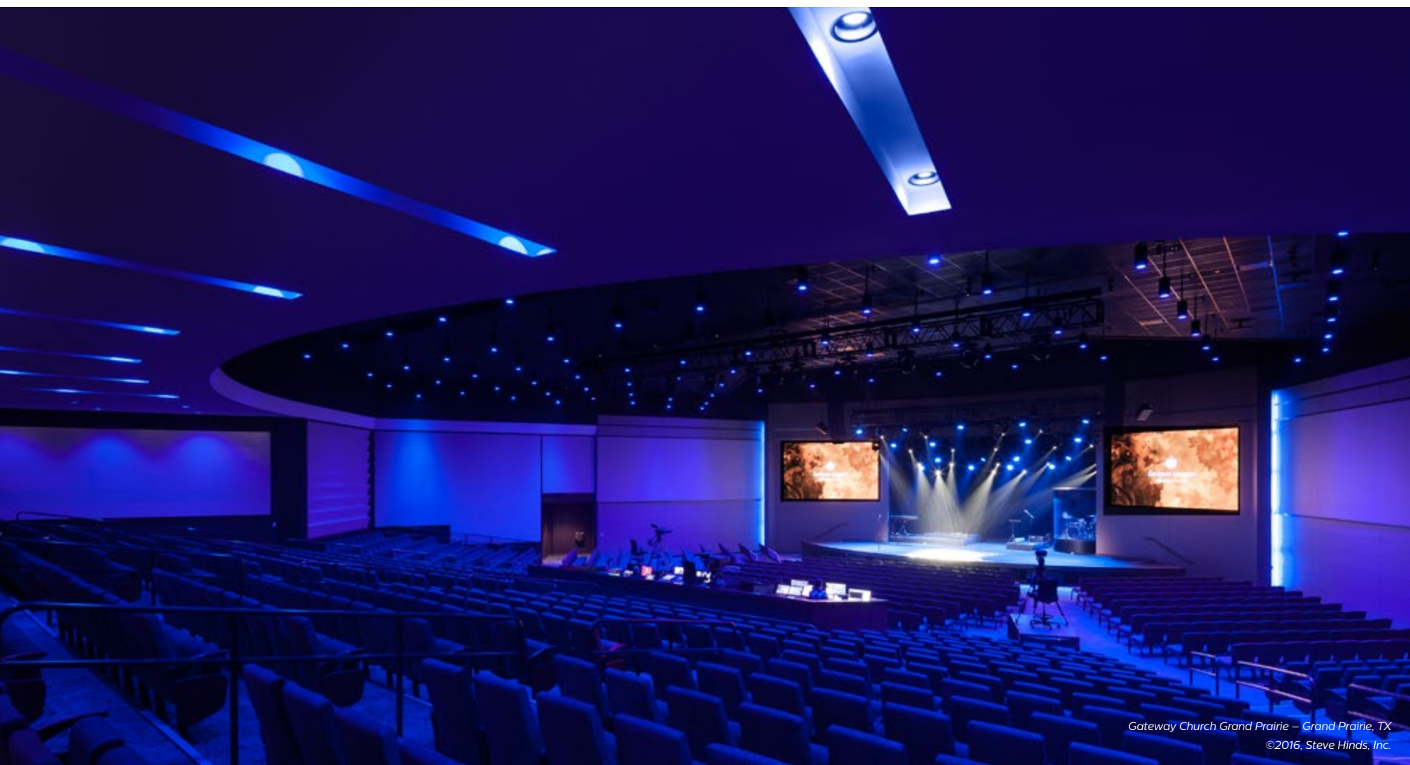
Gateway Church Grand Prairie – Grand Prairie, TX