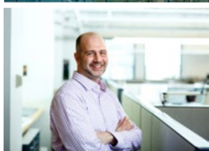
First Baptist Dallas – Dallas, TX