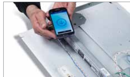
Step 1: Place the smartphone next to the NFC antenna on the driver. Step 2: Follow the on-screen instructions.

EvoKit Gen4 with SimpleSet technology allows the maximum lumen level to be set prior to installation using a smartphone-based app without requiring power to the luminaire. Available in the 0-10V and SR versions only. The app can be downloaded at Google Play. Please contact your Philips representative for the current list of approved Android smartphones. Distributors can set lumen levels prior to shipping, and contractors can set lumen levels prior to installation. Lumen level is quickly and easily set in two steps: